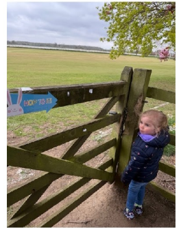
Fun at the Easter Monday trail

Ulgham WI invites you to a COFFEE MORNING on Saturday, 17th May 10-12pm. Come along to see the New Quilted Wall Hanging and enjoy Coffee and Cake etc. This is a free event from the WI to thank Village residents for their continued support.